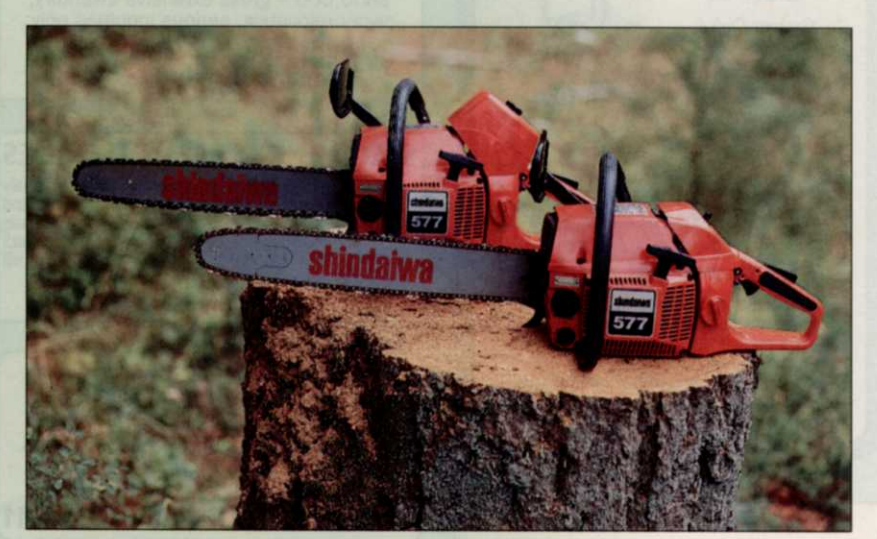
Shindaiwa 577: advanced filter