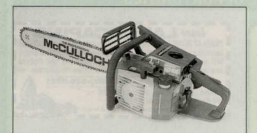
McCulloch 5700: for serious cutters

These are two machines at the opposite ends of the professional spectrum. If—more likely—you want something in between, you'll be surprised how many different kinds of features are available.