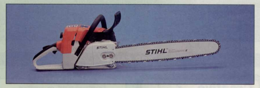
Stihl 044: carburetor is heated