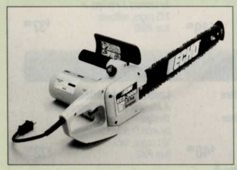
Echo ECS-3000: you like electric?