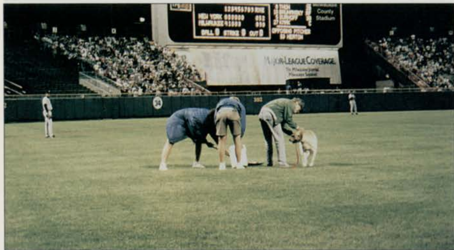
Milwaukee County Stadium ground crew kept shovels and buckets handy for dog emergencies.