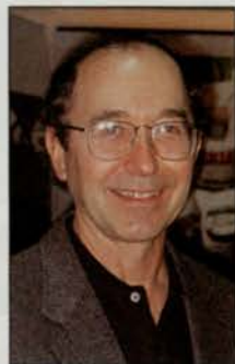
Pepin: Weather conditions a factor in control product efficacy.

"We're going to be short for another couple of years," says Nelson, who suggests that green industry seed buyers get their 1996-97 orders in as soon as possible. □