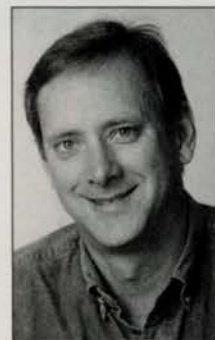
Stanley: Seed prices are likely to rise.