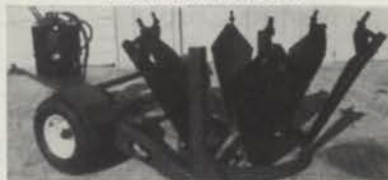
Circle No. 305 on Reader Inquiry Card