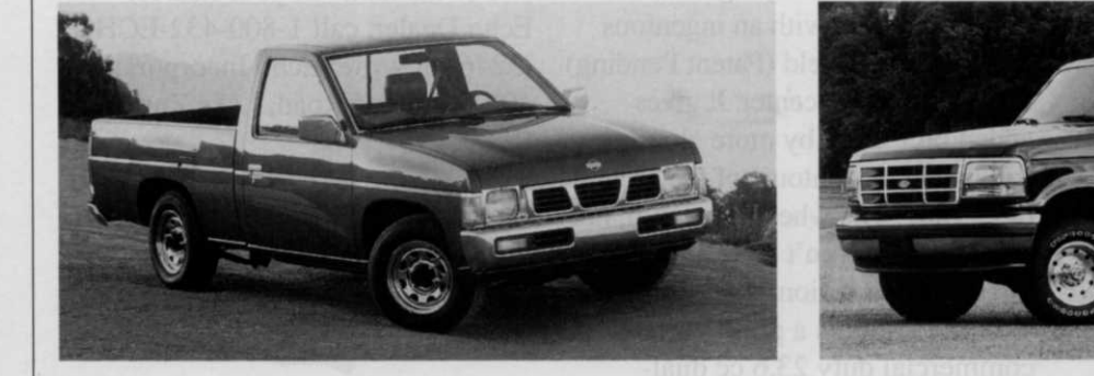
Nissan 4x2 XE

-The author is a freelance writer whose business, FlaxSun Power Fast Sunner, is located in Denver, Colo.