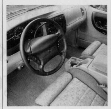
Mazda B-Series interior

Bureau members on select Ram and Dakota pick-ups and Ram vans.