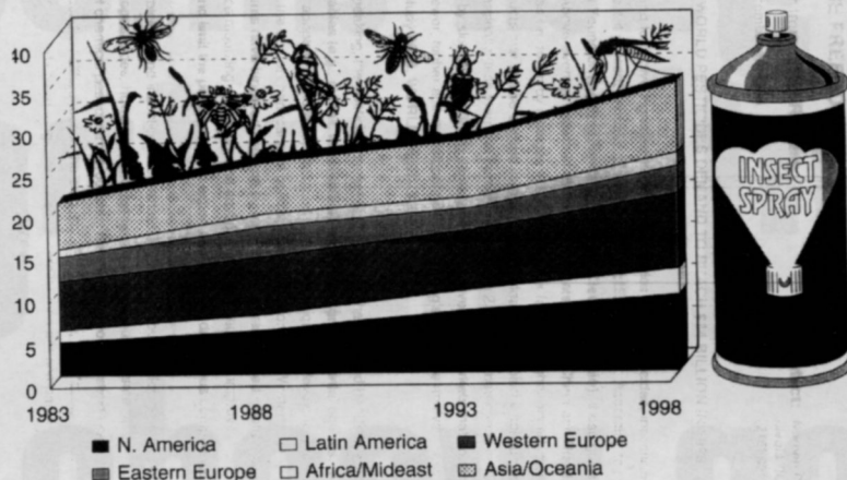
World Pesticide Consumption (billion US dollars)