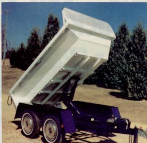
The Maxi-Dump tilts to a 45-degree angle. Circle No. 313