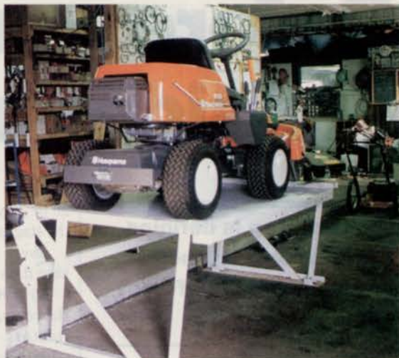
The elevated design of the Spacemaker adds even more room to conventional trailers. Circle No. 317