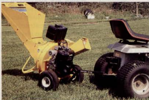
Chippers are more popular than ever. If you have one, consider a chipper hitch from West Side Machine. Circle No. 318