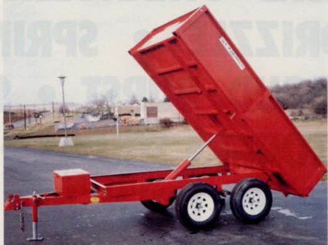
The E-Z Dumper, with breakaway switch, adjustable coupler and swing jack. Circle No. 312

capacity. Brakes are an option for some, and are hydraulic or electric.