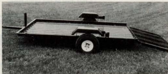
American Pride's golf car trailer has a steel floor and a mesh loading ramp. Circle No. 311

Axles are either single or double (tandem), depending on load