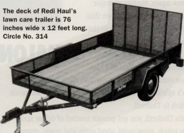
The deck of Redi Haul's lawn care trailer is 76 inches wide x 12 feet long. Circle No. 314