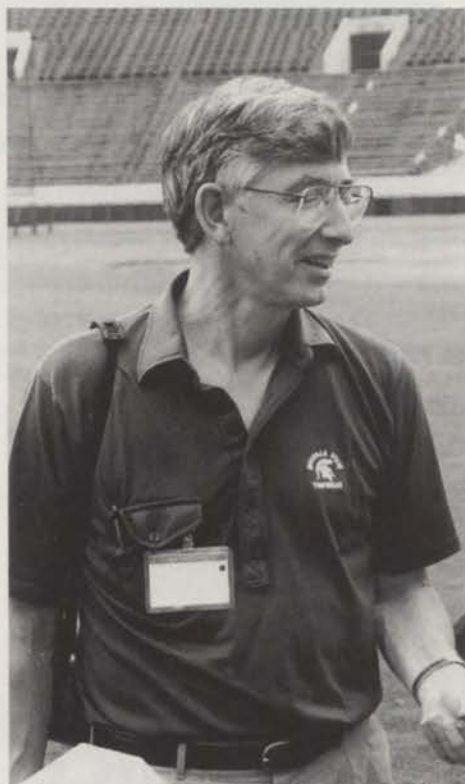
Dr. Rieke says you should supply N after growth ceases, but while soil still warm.

If N has been applied properly in September, the turf should still be green and active. This permits the plant to continue photosynthesis whenever modest