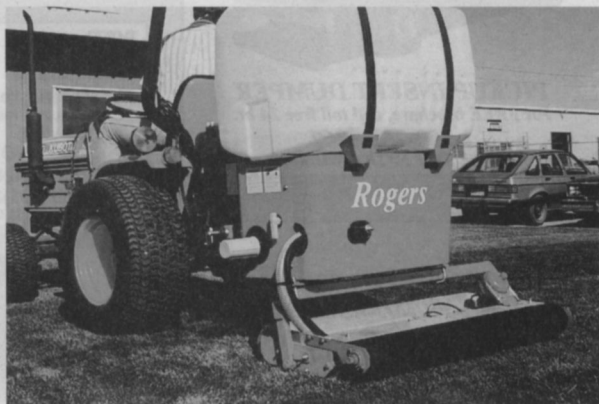
Circle No. 202 on Reader Inquiry Card

Superintendents can aerate greens quickly and efficiently, thanks to a high transport speed.