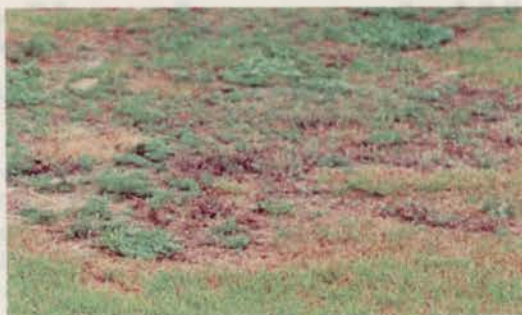
Severe mold cricket tunnelling in bermudagrass. If left uncontrolled, large bare areas totally void of turfgrass result.

☐ Green June beetle grubs tunnel near the soil surface and create unsightly