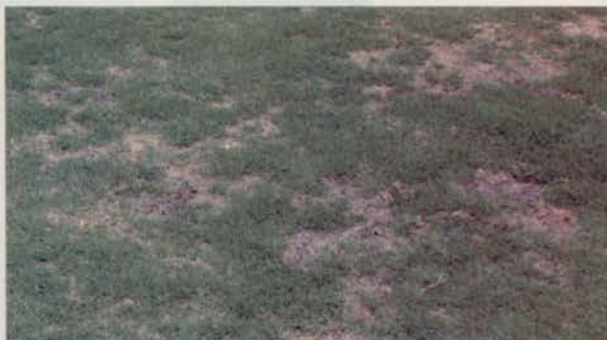
Dead areas in centipedegrass lawn resulting from a severe ground pearl infestation.

During the past two years, we have seen a significant increase in new products like entomogenous nematodes that attack insects, neem seed extract that disrupts an insect's development, and new strains of Bacillus thuringiensis .