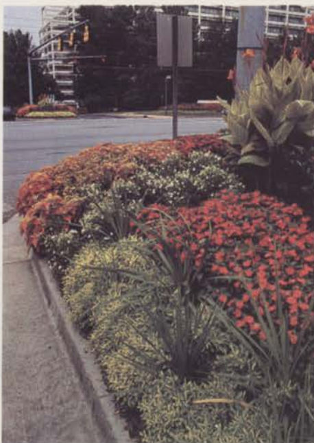
Favorite varieties around Perimeter Center include helichrysum ; balcon geraniums ; amaranthus and eucalyptus .

Center tenants were given a special tour through the park. A shuttle bus was used