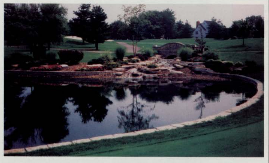
This new water feature separates Westfield's North and South courses.

"Chemical companies didn't have systemics, didn't have a lot of the good fungicides or insecticides," Spodnik recalls, "We'd go to meetings and ask each other, 'What did you use for this or that problem? Did it work?'