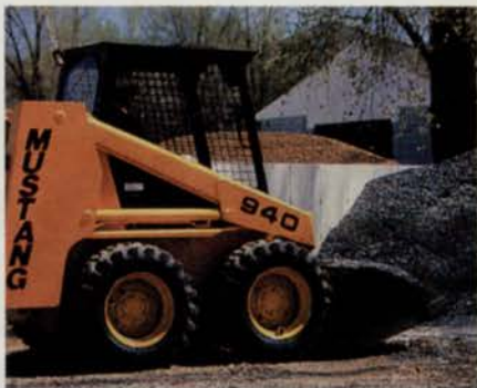
Mustang skid-steer loader in action

To obtain more information, use our easy Reader Service Card and circle the following numbers. For: