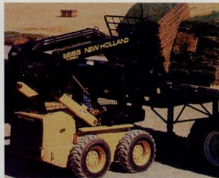
Ford-New Holland skid-steers are available with 30- to 50-hp engines