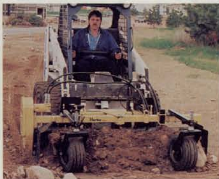
Bobcat with Harley rake attachment

A good variety of attachments are avail-