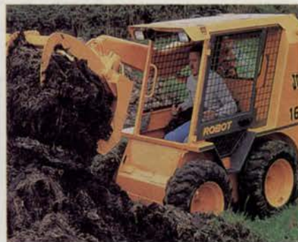
JCB's most popular skid-steer