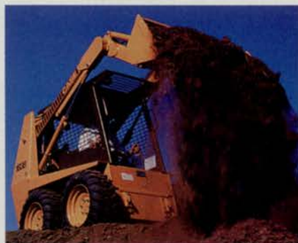
Case's 1838 has a rated operating load of 1300 pounds