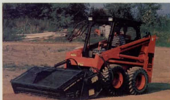
Thomas loader with Rock Hound attachment

Glenmac/Harley makes a line of attachments, including its Model S-6 Power Box Rake that can windrow thrown material to the left or right of the rake. Bi-angular construction permits an operator to angle the single roller and twin barrier bar up to