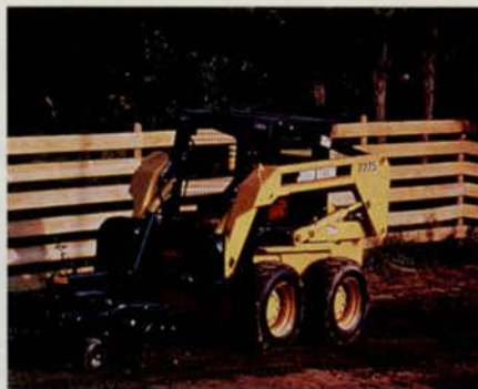
John Deere units carry up to 2000 pounds, depending on model