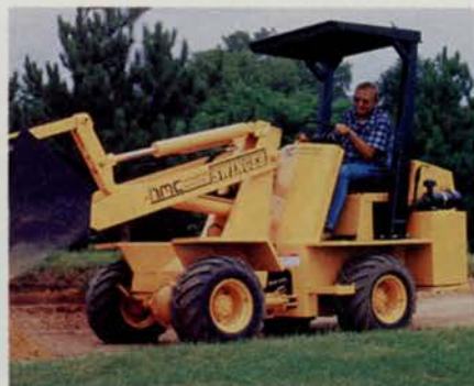
Thomas's Swinger skid steer