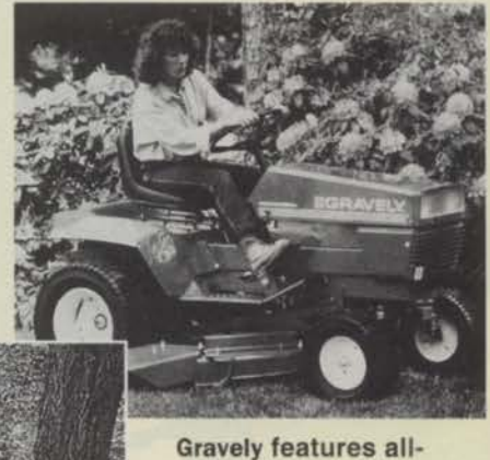
Gravely features allgear direct drive transmissions.