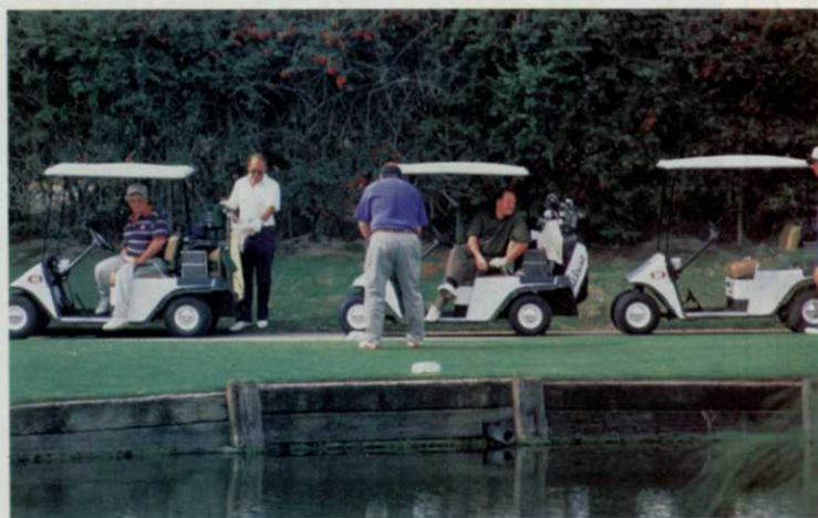
The area surrounding the tee box is one of the strongest focal points on the entire golf course.