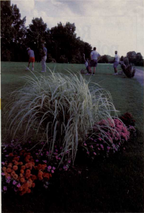
Combine annuals and ornamental grasses for an exotic and colorful impression.

● In tournament or outing play, there is usually a staging area. By need, there's a great deal of hardscaping in this location to accommodate the cart lineup. However, attention to detail and some added beauty