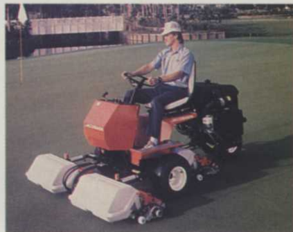
National 68" Triplex is compact, productive. (#324)