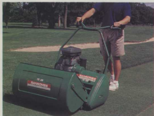
Ransomes TC-28 greens-mower cuts 2,240 sq. ft. of turf per hour. (#315)