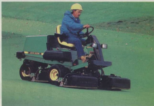
John Deere's 2243 greens mower. (#312)