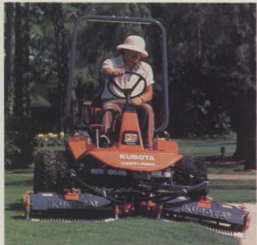
Kubota's Verti-Reel triplex easily converts to a vertical cutter or core buster. (#322)