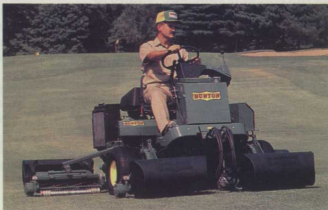
Bunton's fairway mowers have 'cruise control' for steady speed and uniform optimum cutting. (#318)