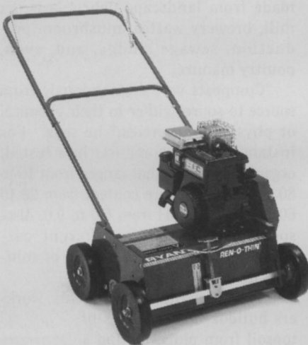
Ransomes America Corporation's Ren-O-Thin features include four interchangeable reels for dethatching, thinning and vertical cutting. (#317)

The Parker Power Thatcher cuts a full 19-inch swath through built up thatch. Three reel attachments to choose from: tine, knife and flail. (#316)