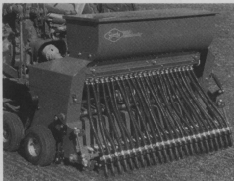
Gandy's dethatcher deck is 540-pto driven from tractors 18 hp and higher. (#312)