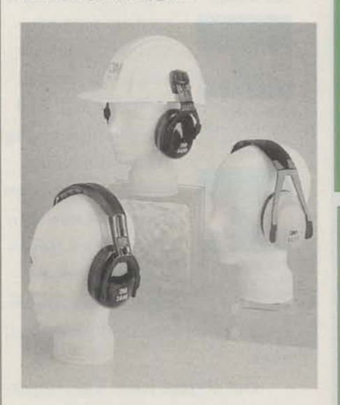
Circle No. 315 on Reader Inquiry Card

Three styles of ear muffs from 3M feature multiple position ear cups. Replaceable ear cushions and molded noise suppression inserts provide for longer uselife and improved hygiene.