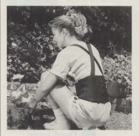
"ride-up," no matter what the activity. Circle No. 316 on Reader Inquiry Card