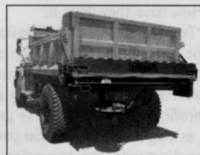
Economical Hiniker tailgate mounted spreaders fit all standard width dump bodies.