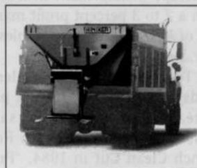
Full-size hopper-type spreaders are available in stainless steel or mild steel versions.