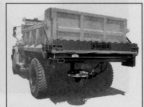
Economical Hiniker tailgate mounted spreaders fit all standard width dump bodies.