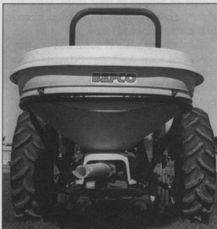
Befco Turbo Hop: 20-66 ft. spread