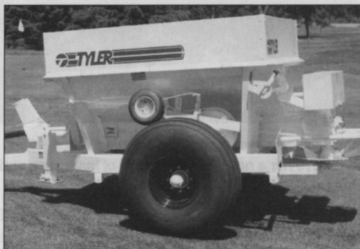
The Tyler F-42 spreads 40 to 50 ft.

Points to consider: versatility, load capacity, width of spread and weight.