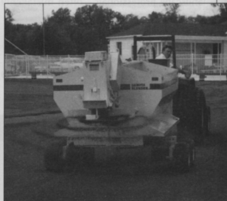
Dakota blender: large capacity, mixes materials for accurate formulations.