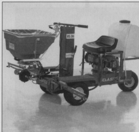
Classen R-36: a 100-lb. hopper for small jobs.