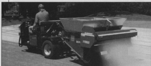
The Ransomes 5th Wheel topdresser has 12 psi ground pressure.