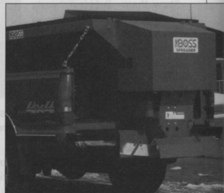
Boss Products' V-Box line: great for snow control