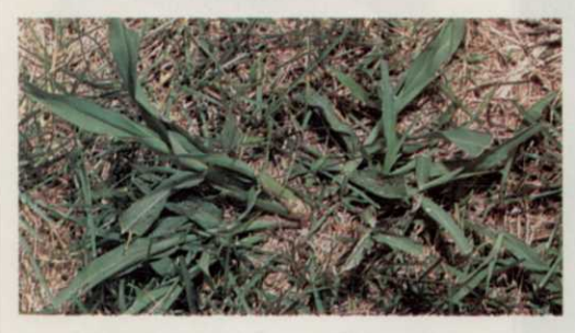
No wonder homeowners hate crabgrass in their lawns.

applications. Routing pressures won't allow it. They have to treat some lawns much earlier in the spring.