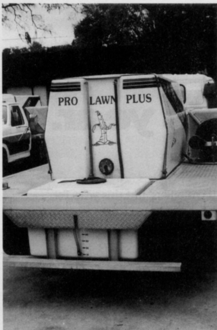
Pro Lawn Plus is using Isuzu trucks this season with 600 gallon main, 100 gallon drop tanks.

"A lot of this is information we can use on our customers' lawns. Sometimes it's information they should know, and we can