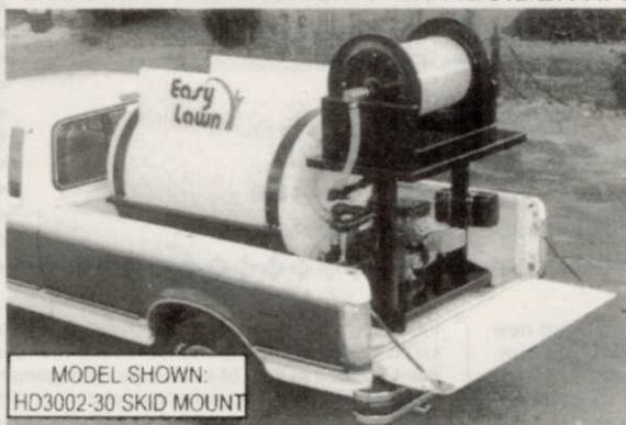
MODEL SHOWN: HD3002-30 SKID MOUNT