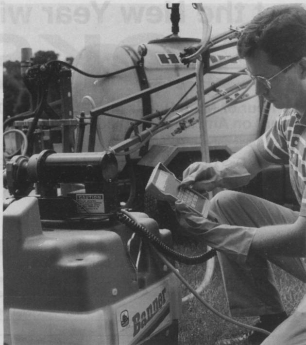
Turfpak features a 15-gallon returnable container, electronic control module and dry-break couplings.

■ During the summer of 1992, Ciba-Geigy successfully tested its Turfpak packaging system, using Banner fungicide for golf course applications and Triumph insecticide for turf insect control.