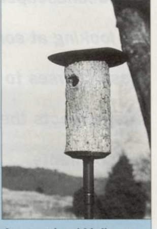
provides birds with a manmade shelter.

14) Preserve natural cavity nesting areas-tree snags-or provide artificial nest boxes. "Don't run out and immediately take down the An occasional birdhouse dead tree," she concludes.