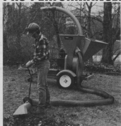
20 & 23 HP