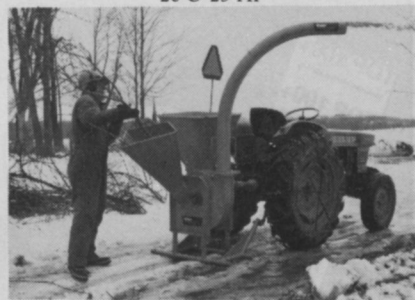
Tractor PTO Drive

AT LAST. A YARD WASTE RECYCLING SYSTEM THAT WORKS LIKE YOU DO. HARD AND SMART.