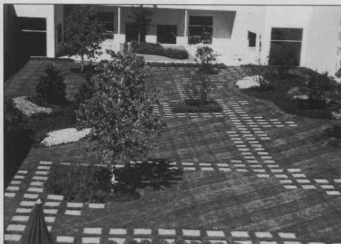
Tandem's design incorporated abundant greenery and bright clusters of seasonal flowers, combining both summer and winter colors.

courtyard landscaping included four individual patio areas, stone walkways, trees and shrubs, annual flower beds and a complete irrigation system. The 22,000 square-foot courtyard acquired the ambiance of a small park.