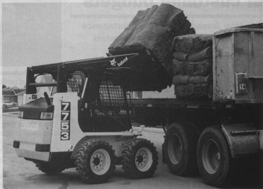
Melroe's Bobcat 7753 has extra lift capacity, smooth ride, easy handling.

tioner has hydraulic driven vibrating blades with bullets. Its working width: 27 inches. Blade spacing: 9 inch with adjustable 2- to 7-inch controlled depth. It requires a 13 hp tractor with 540 PTO and 3-point hitch.