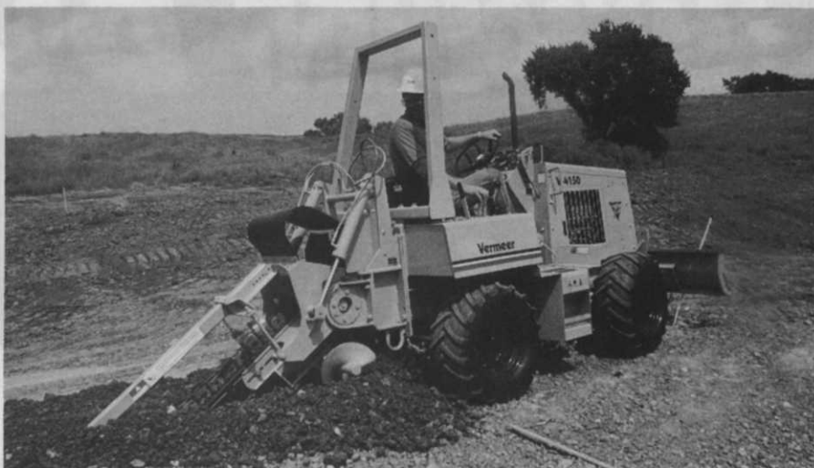
Vermeer's two new trenchers feature easy operation in a number of ways.

According to Teledyne Princeton, the Piggyback Material Handler is the strongest, most versatile machine of its kind. It can lift and load 3,000 to 5,500 lbs. with complete stability, since the load—