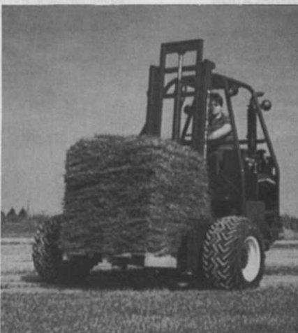
The 60-inch-wide Piggyback can carry loads from 3,000 lbs. up to 5,500 lbs.

• "A Course of a Different Texture:" Zoysiagrass is not for everyone. But it works perfectly for Alvarado Country Club in Lawrence, Kansas.