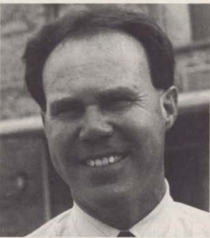
Schlossberg: extra labor now needed

"We would need extra labor for either the phone calls and/or physically making a special trip to the property just to put the