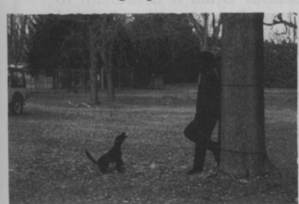
Circle No. 203 on Reader Inquiry Card

Silawnets are life-size silhouettes which make eye-catching additions to lawns, gardens or golf courses. They are available in a variety of people and animals, including golfer silhouettes. They are constructed of durable colorfast black, rigid plastic.