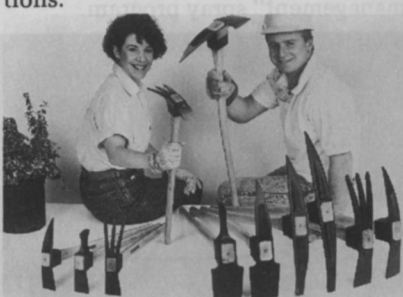
Circle No. 200 on Reader Inquiry Card

The company says the nine tools will perform 18 different job functions.