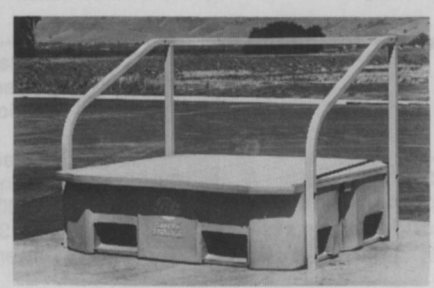
Circle No. 206 on Reader Inquiry Card

The pallets are designed to accommodate up to four 55-gallon drums or other types of containers weighing up to 5775 lbs. maximum storage capacity.