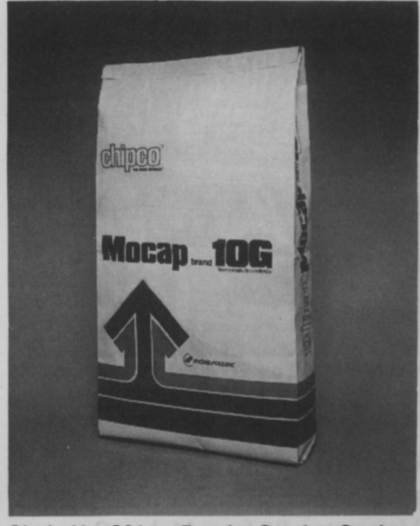
Circle No. 201 on Reader Service Card continued on page 59

After application, Chipco Mocap 10G needs watering or soil incorporation.