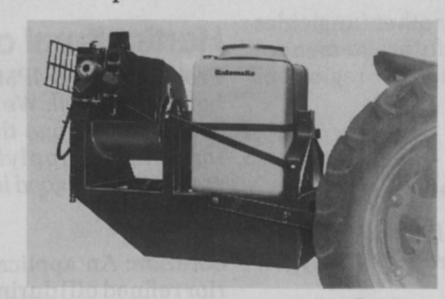
Circle No. 205 on Reader Inquiry Card

The unit hitches to a tractor and has a triple V-belt drive.