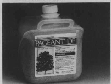
Circle No. 192 on Reader Inquiry Card

Pageant protects trees and shrubs from virtually all troublesome worms, beetles, borers, scales and aphids. When the spray dries, it bonds tightly to trees and shrubs, and doesn't wash away, even in heavy rain. Comes in a convenient dry flowable formulation.