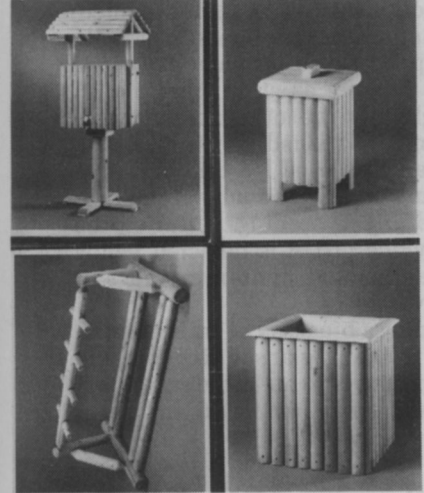
Circle No. 202 on Reader Inquiry Card

The firm also manufactures a cedar log rack for the bag drop area. Green Pro says the accessories are maintenance free and competitively priced.