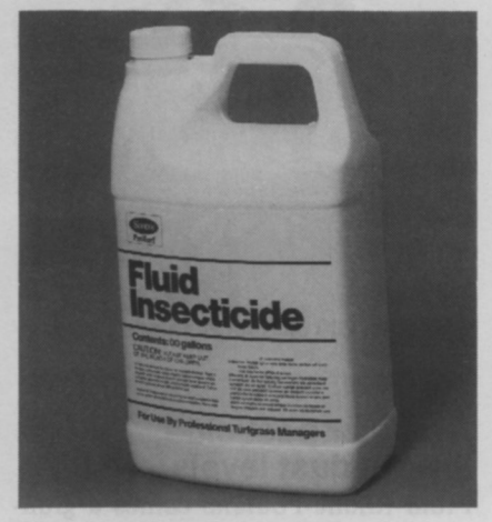
Circle No. 191 on Reader Inquiry Card

Scotts says the water-based formulation is easy to handle and mix, and fits easily into an "integrated pest management" spray program.