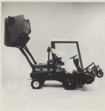
Ford Holland rider with hopper

are available for both mulching or addition of a 2.25 bushel rear bag collector.