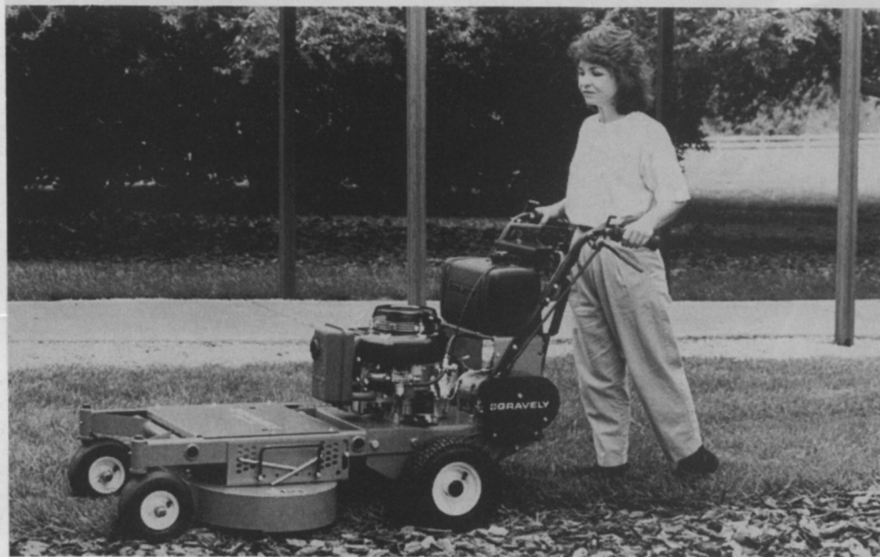
Gravely Pro Series