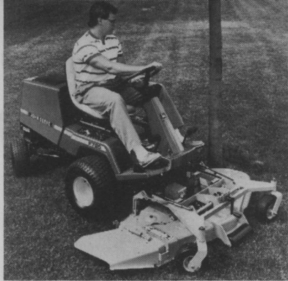
John Deere mid-sized front loader