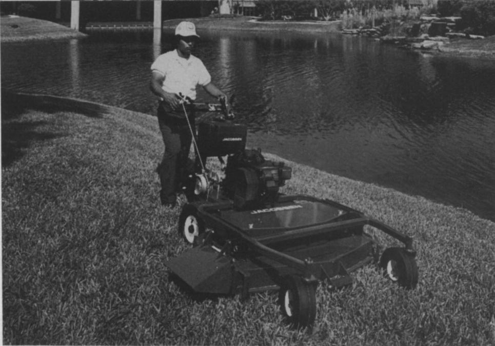
Jacobsen Crew King