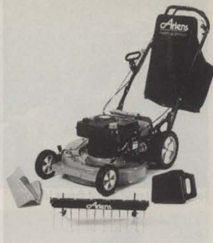
Ariens mowing system

complexes, condominiums and other landscapes in mind, Excel compact riders are with 18 and 20 hp powerplants and 51- or 60-inch mowing decks.