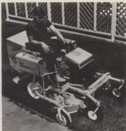
Excel rider with edger

The manufacturer also offers two new triple-bag grass collection systems. The 9.75 barrel capacity bushel