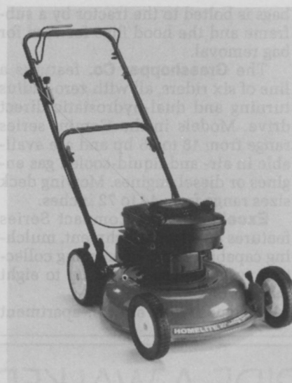
Homelite mulching mower

Equipped with power steering, model F710 comes with a 48-inch mower; model F725 with a 54-inch mower.