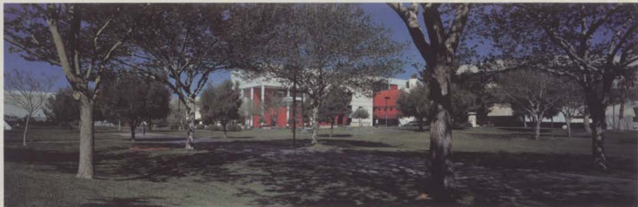
The UNLV campus, an oasis in the middle of the southern Nevada desert, is seen in all its splendor in the spring.

PEOPLE from page 22 director of university news and publications.