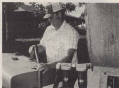
Circle No. 207 on Reader Inquiry Card

As water accumulates, fuel flow becomes restricted, signalling that it's time for an element change.