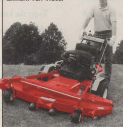
Exmark Turf Tracer™

Large-deck productivity plus a smooth, beautiful cut can be yours with an Exmark Turf Tracer™, Turf Ranger™ or Explorer™. Unique floating decks glide over uneven terrain for a perfect cut that will make you proud. We invite you to ask your dealer for a demonstration and experience all the advantages of Exmark's floating deck performers. For the dealer nearest you contact Exmark: 402/223-4010