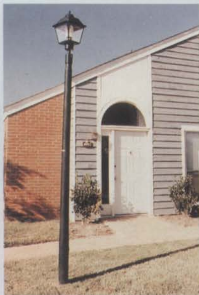
Lighting at the Watergrove Apartments has enhanced the development's reputation as a safe place to live.

Working with Memphis Light, Gas & Water, Watergrove developed the street lighting plan relying on traditional pole-mounted luminaires employing high-pressure sodium (HPS) lamps. First, the lamps' "golden white" color is distinctive, permitting us to better define circulations throughout the project. In addition, HPS lamps are among the most efficient lamps available and have a rated life of more than 24,000 hours. In other areas, we used more traditional "white light" sources. Thus, metal halide and incandescent lighting is used to highlight the bridges, pools, and clubhouse, and quartz lighting is used to illuminate six "floating fountains" installed in natural pools. Using different types