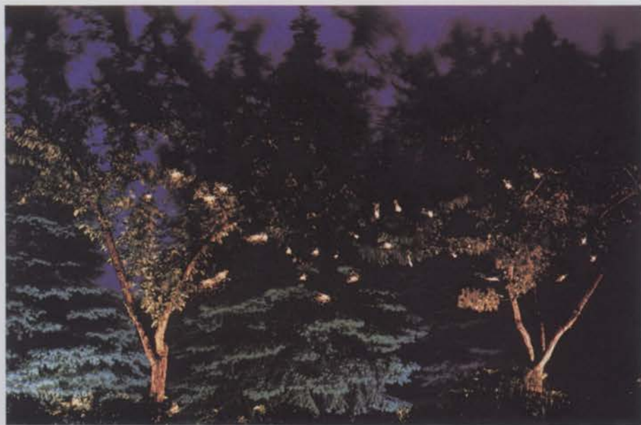
Let the client decide if they want colored lights, since colored lighting is subjective and emotional and brings out different patterns and textures.

● Be aware of light pollution. What is happening