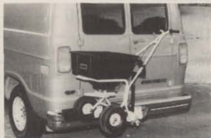
Circle 191 on Reader Inquiry Card

The carrier, developed to avoid interior fertilizer spills from spreaders while in transport, comes with two adapters to accommodate LESCO, Spyker and Ev-N-Spred models and other popular designs. The device is affixed to the rear bumper of the service vehicle. It is easily installed and more than 200 pounds. The unit weighs 21 pounds.