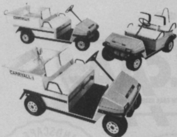
Circle No. 197 on Reader Inquiry Card

available in gas or electric. The Tour All features a true balance suspension system with self-adjusting rack and pinion steering to deliver a true power steering feel and a 17'6" clearance circle.