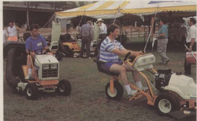
Lawn care professionals drove them around the block a few times at the OPEI show, Expo '90, in Louisville, Ky.

100th anniversary during the Expo '90 by adding the W5021-PCC walk-behind mower to its commercial turf-maintenance line.