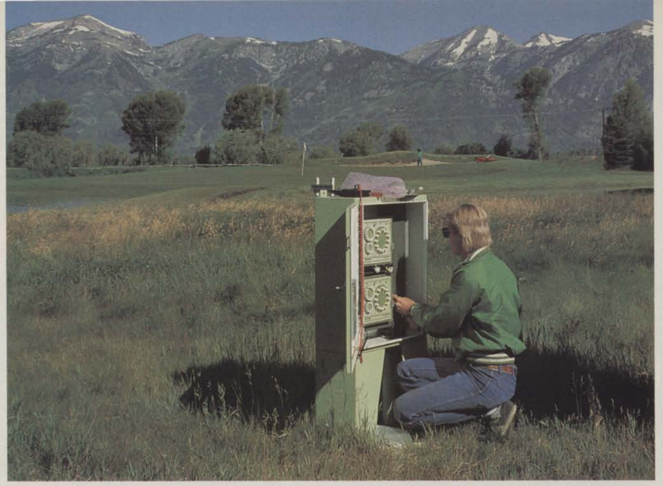
Superintendent Brian Heywood opens his gear drive and impact rotors before using a 185 or 205 cfm air compressor to blow out all the water.