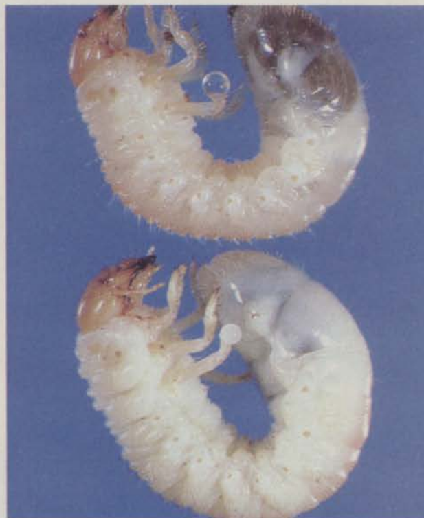
Japanese beetle larvae infected with milky disease (top), and a healthy grub. Subsurface placement of milky disease products should significantly increase their effectiveness.

Greenbug —Severe infestations of greenbug have been known to occur as late as the first week of December. Areas having a history of infestation should be re-examined when mild temperatures extend late into fall. Heavily-infested turf will not survive through winter.