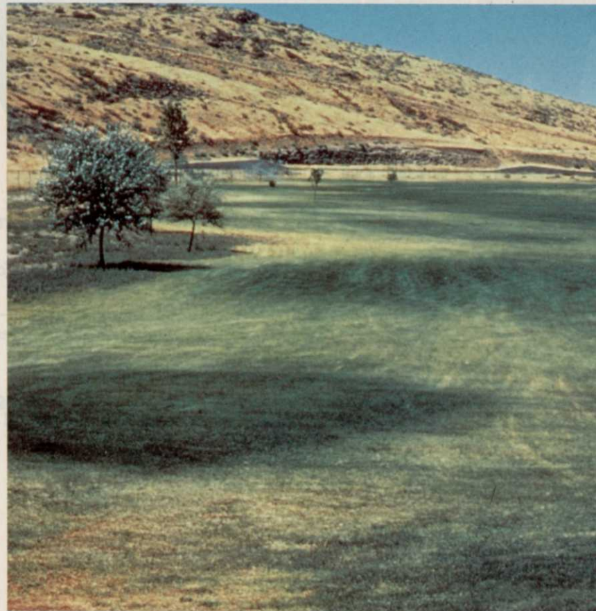
The effects of a poorly-designed irrigation system include over-watering, pest and disease problems.

Always remember, the wind factor can adjust these formulas up or down. Trying to save money by using the fewest heads should be discouraged, so always make sure the designer stays within the manufacturer's performance specifications.