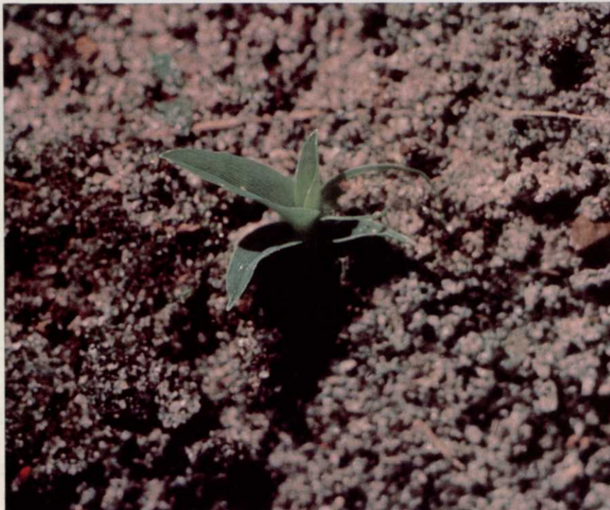
Post-emergence herbicides are generally effective only for weeds that have emerged, and are less effective when the weed is under heat or drought stress.