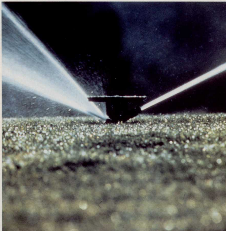
Though today's irrigation equipment is engineered for quality and performance, proper application of the technology is crucial for a good installation.

Armed with this data the designer can start the actual system layout, usually beginning with the sprinkler head placement. The most important criteria when laying out sprinklers is to insure an even amount of precipitation throughout the system's area of coverage. Normally this means the throw radius of one sprinkler reaching the next sprinkler, or "head-to-