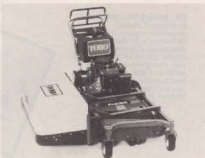
The Magnum 16-hp twin cylinder

Toro says the Kohler Command 14-hp OHV engine provides extra cutting power for tough mowing applications. It features full pressure lubrication and hydraulic valve lifters for long life. Laminated steel packaging and a large multi-chambered muffler decrease engine noise. An optional electric start kit is available.