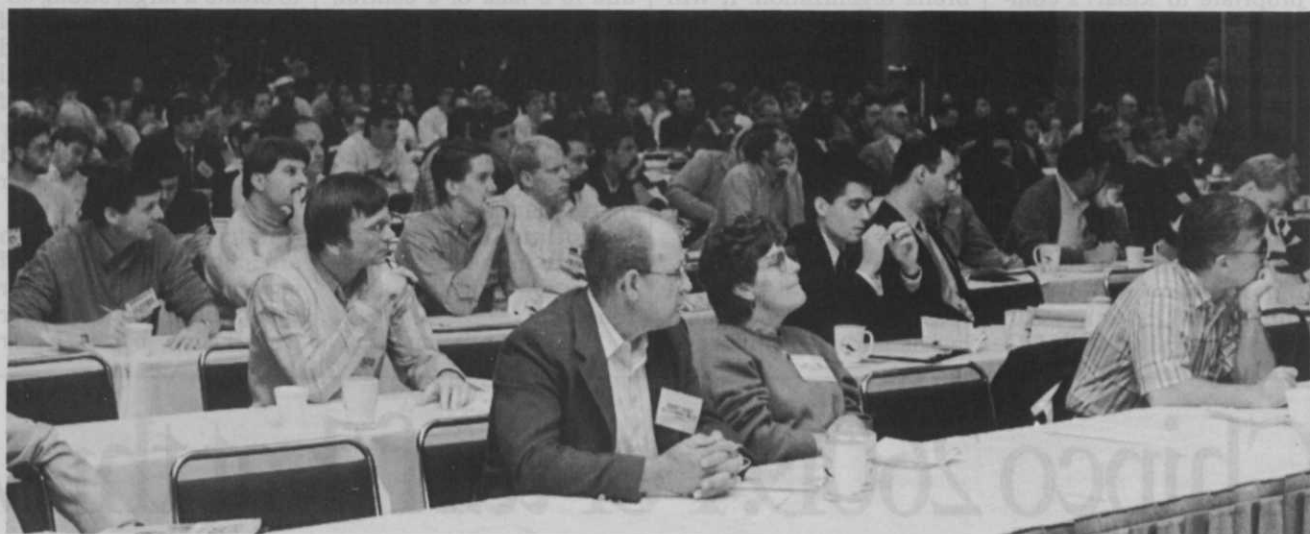
A packed room of landscape managers sits enthralled during an educational session at Expo '90 in Nashville