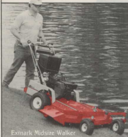
Exmark Midsize Walker

Exmark's Turf Tracer™ and Midsize Walkers eliminate dangerous downhill runaway and freewheeling. Five speeds and positive reverse provide exceptional handling. We invite you to ask your dealer for a demonstration and see for yourself how Exmark commercial mowers keep you in complete control. For the dealer nearest you call Exmark: 402/223-4010