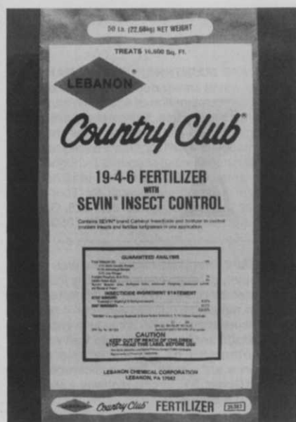
Circle No. 208 on Reader Inquiry Card

armyworms, chinch bugs, cutworms, earwigs, grasshoppers, sod webworms and ticks.