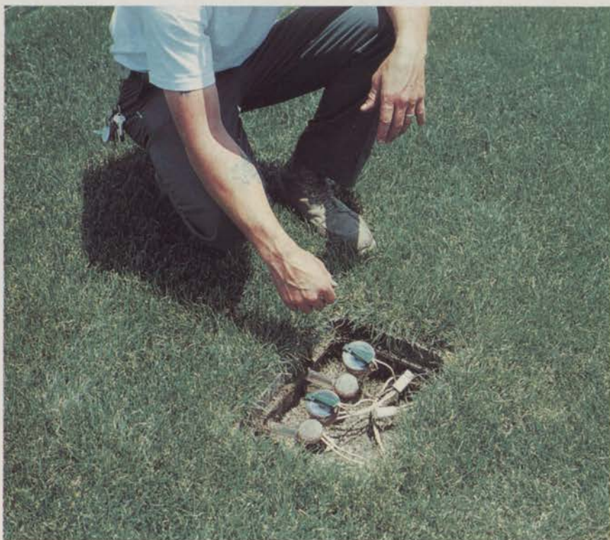
Tensiometers can determine the point at which soil saturation, field capacity and permanent wilting occurs within a particular soil profile.