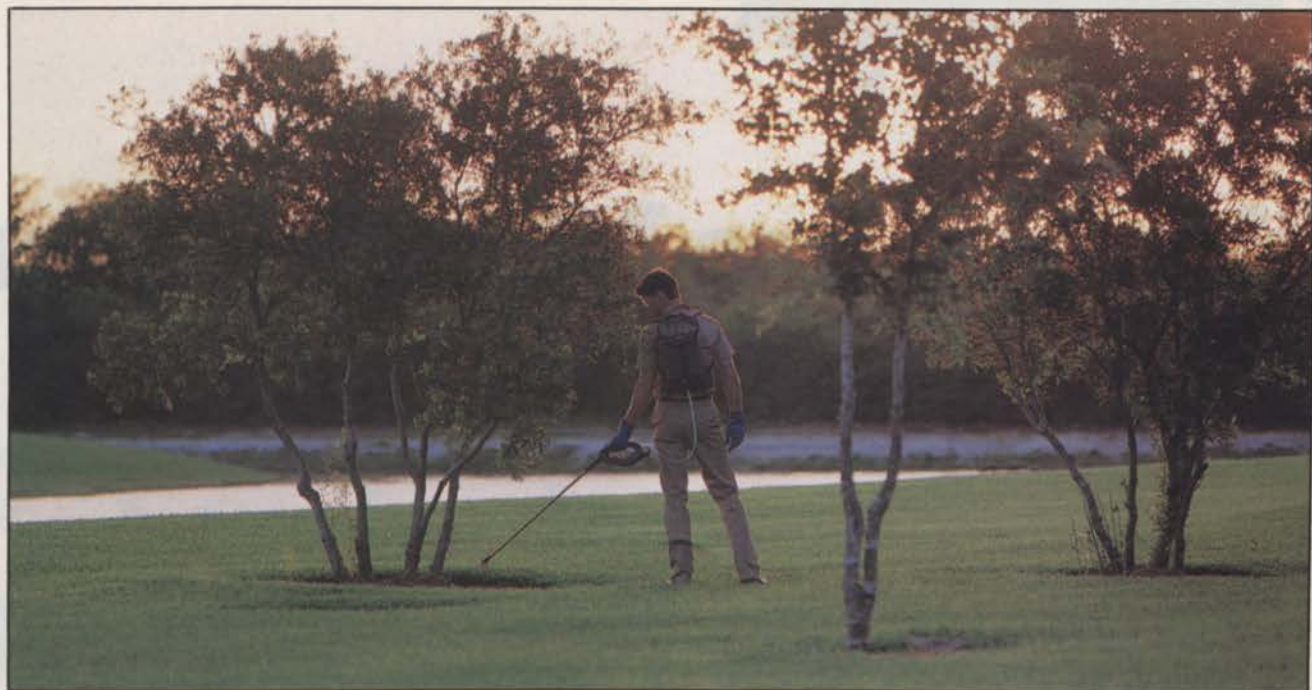
The Expedite system, shown here, eliminates almost all chances for accidents, according to landscapers who use it.