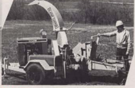
Model 986 — Hydraulic feed disc chipper features: 12" capacity, variable feed rate, gas or diesel, and 15° curbside feed angle for safety.

Write or call your local Olathe/Toro dealer for free demo or call 1-800-255-6438