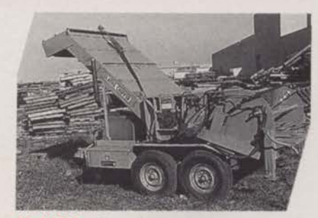
Model 864 — Gets volume reduction of pallets and wood debris for increased disposal capacities

Olathe Chippers reduce bulk — cuts down time to landfill sites. Provides mulch for safety and beautification programs. Olathe manufactures five models to handle your chores — from 8 hp 2½" capacity to 175 hp 12" diam. capacity. With units in the field for over 15 years, Olathe keeps proving itself as a leader in the chipper field.