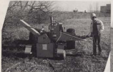
Model 12 — PTO, 3 pt. hitch or tow-type, 7" capacity, 500 lb. drum