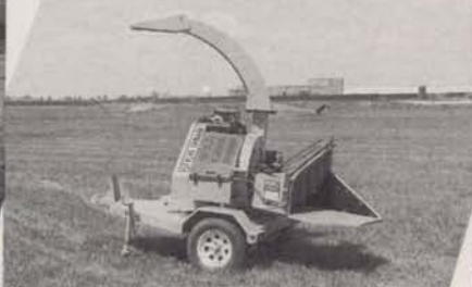
Model 182 — Brush chipper reduces limbs and brush up to 6" in diameter quietly and efficiently.