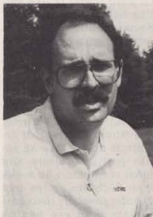
Prest: "more players through each day"

Part of the image upgrade has been accomplished by gradually adding sand traps. "There aren't many public courses with extensive sand," explains Prest. He is placing the traps in such a way that they don't slow down play. "There's nothing worse than a four-hour round of golf that turns into six hours," says Prest. "We've placed these fairway traps