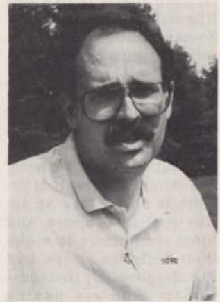
Prest: "more players through each day"

Part of the image upgrade has been accomplished by gradually adding sand traps. "There aren't many public courses with extensive sand," explains Prest. He is placing the traps in such a way that they don't slow down play. "There's nothing worse than a four-hour round of golf that turns into six hours," says Prest. "We've placed these fairway traps