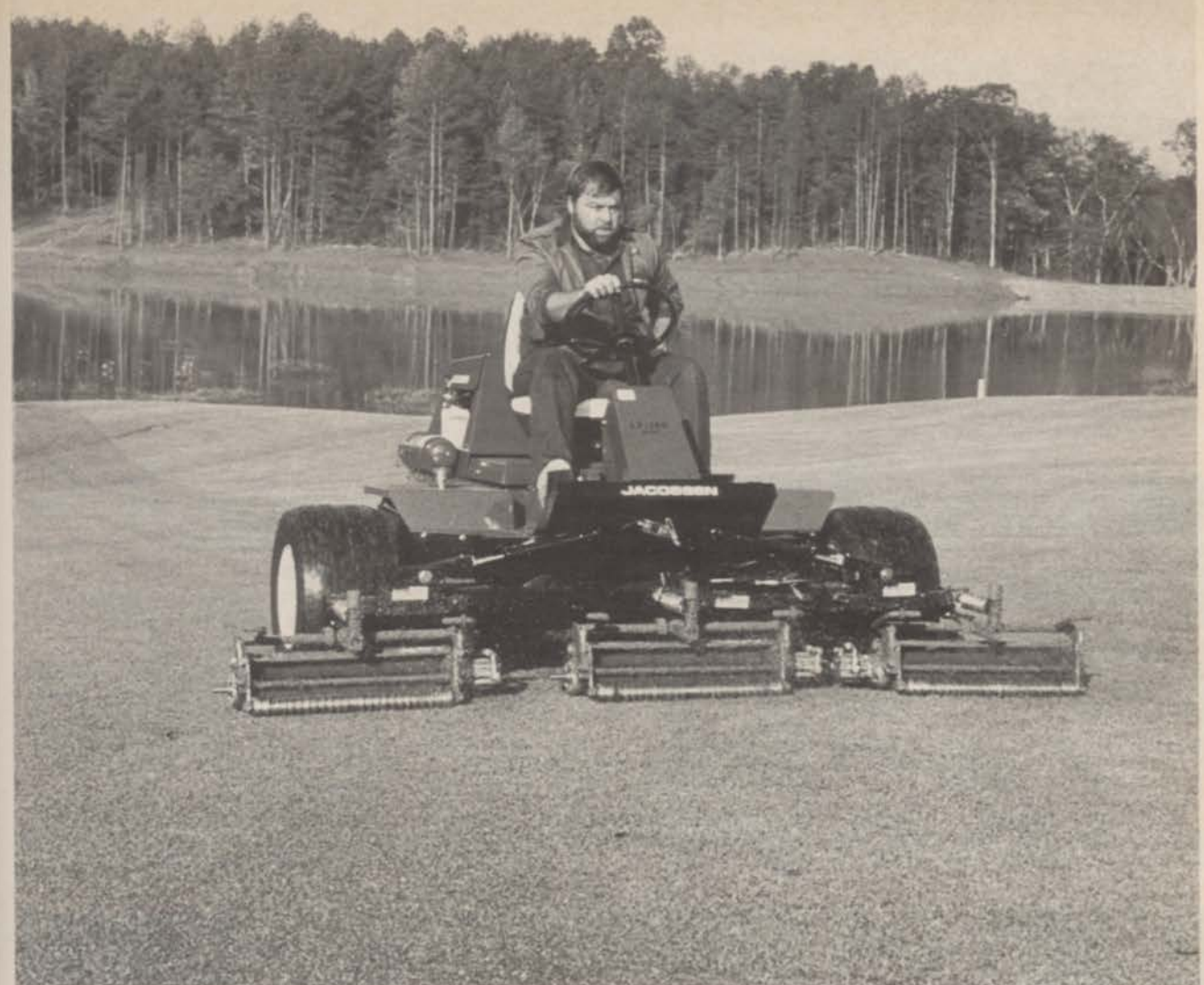
Riding mowers are more stable going up and down slopes.